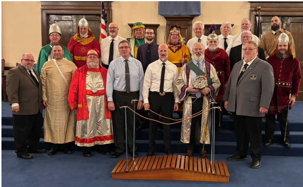
Sir Knights of Nativity No. 71 and Mizpah No. 96 held a joint conclave and conferred the Order of the Red Cross on three new members. Congratulations to all on a great conferral!

Send photos of your commandery conclaves and events (along with a caption) to the REGC ( josh.nay@gmail.com ) for inclusion in future issues of the PA Crusader!