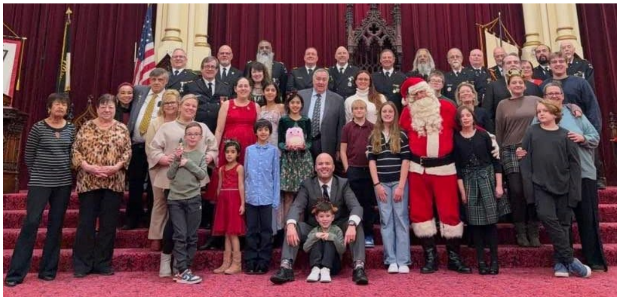
Sir Knights and families of St. John's Commandery No. 4, stationed in Philadelphia, at their annual Christmas Observance and party.