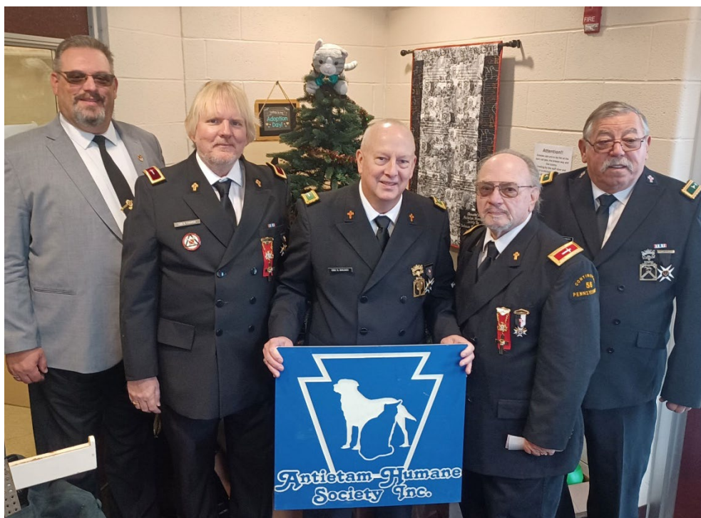
Sir Knights of Continental Commandery No. 56, stationed at Chambersburg, delivered the results of their annual drive to the Antietam Humane Society in Waynesboro, including $850 in donations and much needed supplies.