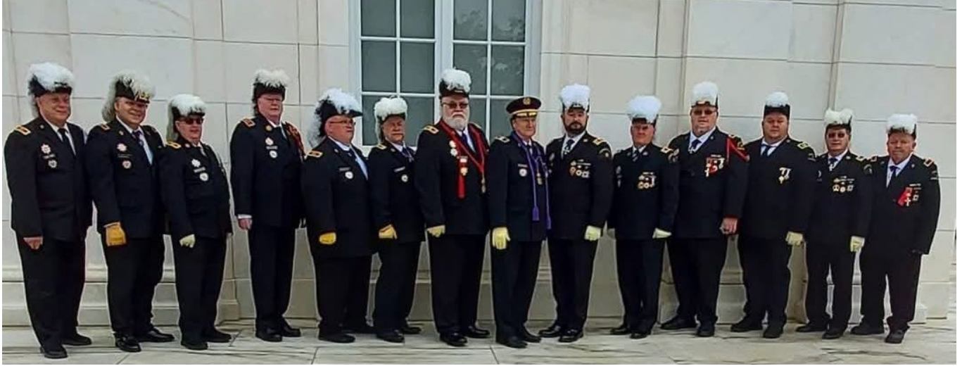
Easter Sunrise Service at the George Washington National Masonic Memorial